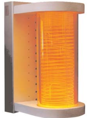
Illustration of furnace visual transparency showing element coil.

In a conventionally insulated single zone tube furnace, reasonable temperature uniformity is generally limited to the central third of the furnace heated length. Beyond this distance, the temperature drops off rather rapidly due to heat losses at each end. Through proper design of the tubular heating element coil and the uniformity of the continuously reflected infrared energy, excellent temperature uniformity can be achieved over 60% of the heated length in the Carbolite Transparent Tube Furnace.